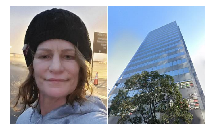
'Bullied' LA Health Department worker jumps 18 stories to her death