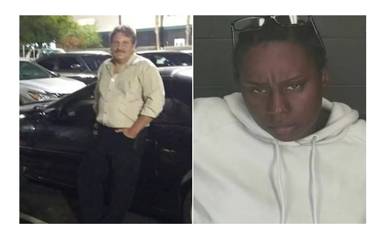
California grandpa, 59, is shot and killed